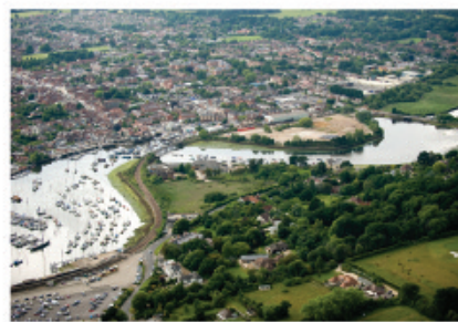
Left and above

A simply magnificent view over Portsmouth looking out to sea. The naval dockyard is on the left with Gosport far right. The Gunwharf Quays are dominated by the needle-like Spinnaker Tower.