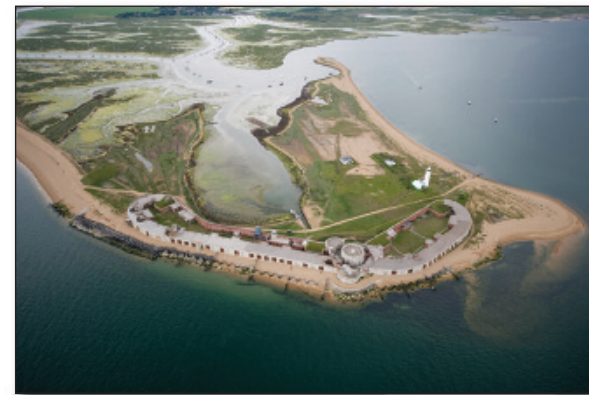
Hurst Castle was built by Henry VIII as one of a chain of fortifications along England's southern shore.

One of the most famous boatbuilding and yachting areas in the country is centred on the River Hamble.