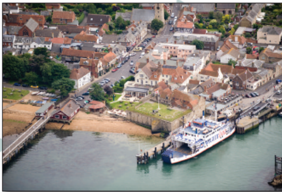
Ferry at Yarmouth Harbour, Isle of Wight.